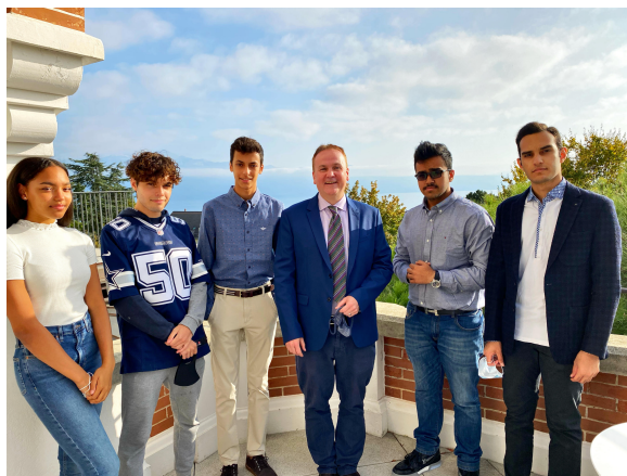
Brilliantmont YIS Club in Lausanne, Switzerland